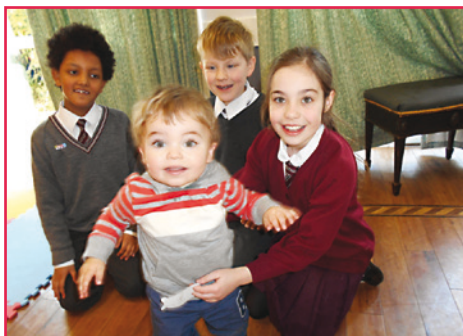
The Mother & Toddler Group

The pupils help the toddlers with a variety of activities including: crafts, puzzles, playing with toys and reading stories. There has been very good feedback from parents who report that their toddlers really enjoy interacting with the older children. The experience is also beneficial to the pupils as it improves their communication skills and builds their confidence.