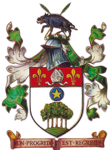
The Arms of Ruislip-Northwood Urban District Council (the motto means "Not to go forward is to go backwards")

become the Supreme Court of the United Kingdom.