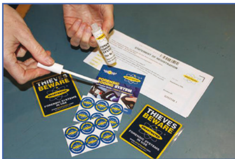
The Met Trace Kit

Police in Hillingdon Borough will soon be distributing free kits containing invisible traceable liquid to over 8,500 homes. Known as Met Trace, this is the world's largest roll-out of an innovative 'traceable liquid' to reduce burglary rates across London. The programme, which will run over three years, will provide homes in burglary hotspots with a free kit containing an invisible traceable liquid, allowing owners to mark their possessions with a unique forensic code and to display warning stickers to deter burglars. Police can then use this code to trace the items should they ever be stolen and to link suspects to crime scenes.