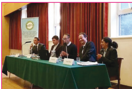
Candidates for Ruislip, Northwood and Pinner attend a Hustling at the Pinner Liberal Synagogue (the Labour candidate was unable to attend due to illness)

shock to some or a great relief to others. It may herald a time of great change or even, for some, great dismay. In this sense waiting for Thursday 7th May is, for a politician, very exciting. What will the people decide?