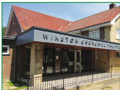
The Winston Churchill Hall

Next Meeting: 7.45pm, Thursday, 22nd October 2015, Winston Churchill Hall ♦