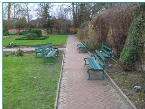
Eastcote House Walled Garden before the FEHG got to work

Over and above the weeding, a transformation of the gardens, buildings and Long Meadow Conservation Area, has taken place.