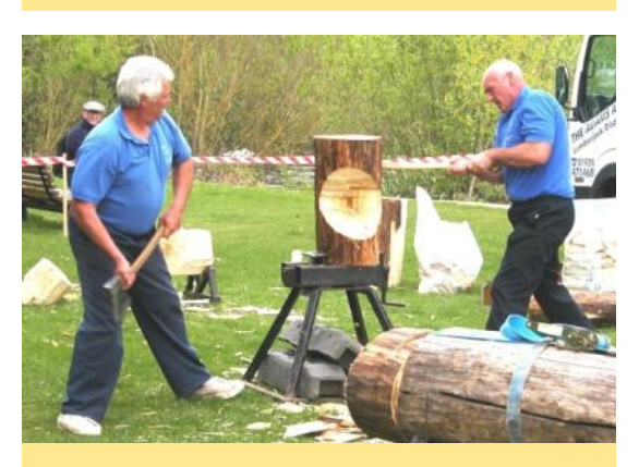
I'm a lumberjack and I'm OK.... 13th Ruislip Woods Open Day, back cover