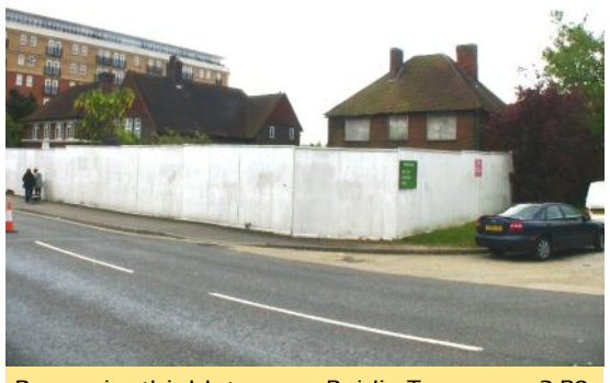
Recognize this blot on our Ruislip Townscape? P8