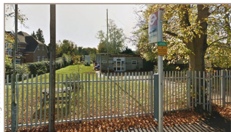
Ladygate Lane Scout Hut

The proposed replacement of the Scout hut in Ladygate Lane with four houses was finally approved last October. Presumably, with agreement already reached on the upgrade of their St Catherine's Road site, we can expect to their new facilities in the not too distant future.