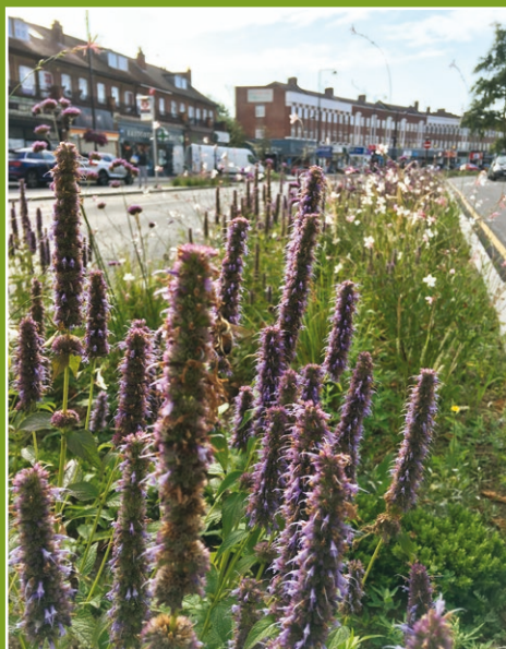
An example of a rain garden in Eastcote High Street

“The council works hard to maintain land and gullies it has responsibility for, and we are currently working together with Thames Water and the Environment Agency to reduce flood risk to residents in Ruislip. We would also encourage residents to help protect their homes against the risk of flooding by managing property drainage and working together as a community to improve your area's flood protection.”