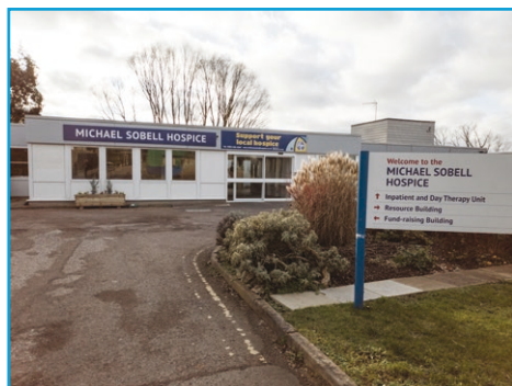
The Michael Sobell Hospice

The hospice is now run by Harlington Hospice working with Michael Sobell Hospice Charity,