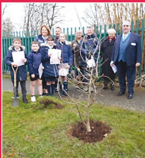
Sacred Heart R.C. Primary: Pupils, Staff & Guests after Planting the Tree