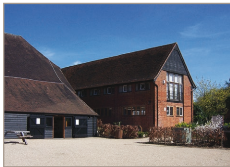
The Manor Farm Library

house and some internal alterations in Manor Farm Library.