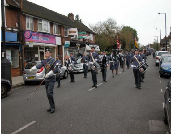
Remembrance Parade—Ruislip High Street

The Voice of Ruislip Residents January 2011