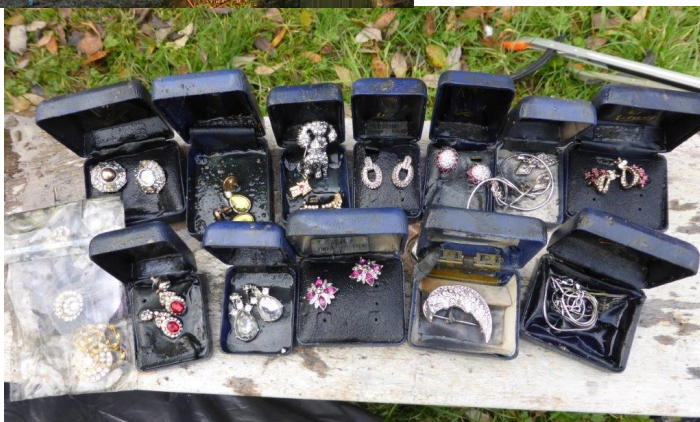
Jewellery find in the River Pinn (page 16)