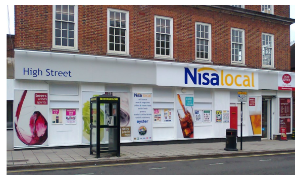
Ruislip Post Office - May 2012