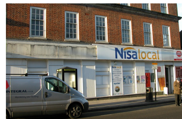
Ruislip Post Office - January 2014 Is this an improvement? What happens next? (see page 21)