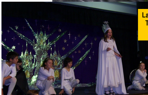
Lady Banks Junior School The Snow Queen and her Acolytes (page 20)