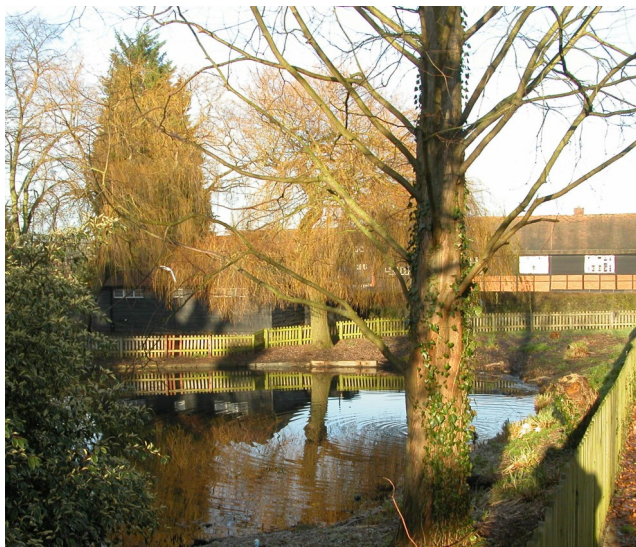
Volunteers have helped to tidy up the Manor Farm pond