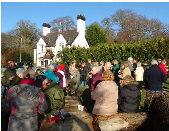
New Year's Day Walk—refreshment break