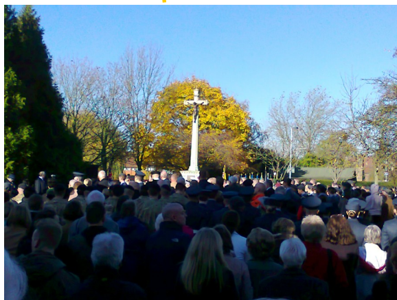
Ruislip - Remembrance - November 2012

The Voice of Ruislip Residents February 2013