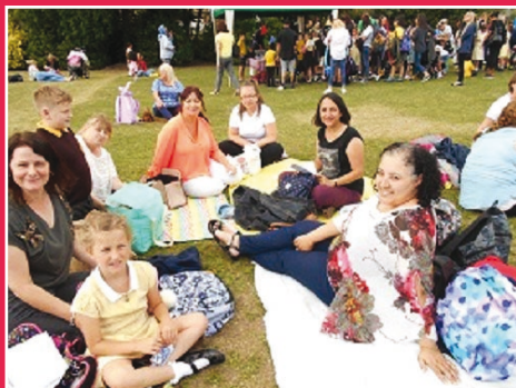
Relaxing at Lady Bankes School's Celebration