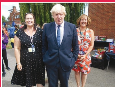
Boris Johnson was a surprise guest at Lady Bankes Schools' Celebration