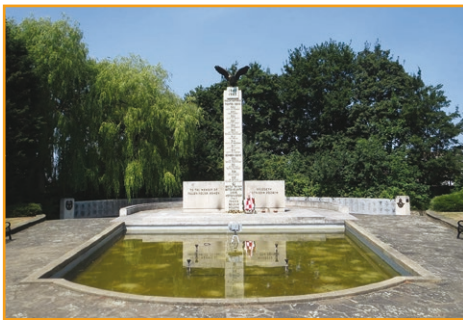
The Polish War Memorial

West End Road provided a route through the common fields of Ruislip. Apart from the bend at Field End, it is now fairly straight as various small watercourses have disappeared underground. It crosses the Yeadling Brook twice, at White Butts (around Ruislip Gardens Station) and again near the Polish War Memorial. White Butts Bridge was a trysting place where Americans and White Russians who were stationed at Northolt Aerodrome in 1917 used to meet Ruislip girls for a chat. Only the Americans were invited home for tea! ♦