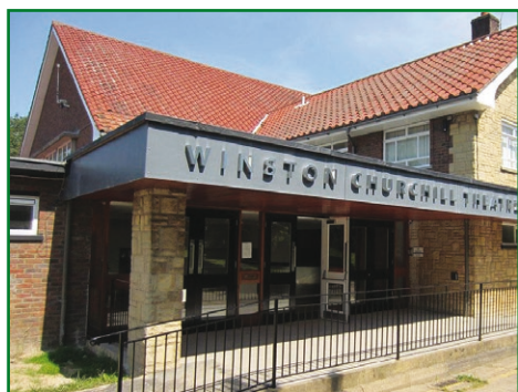
The Winston Churchill Hall