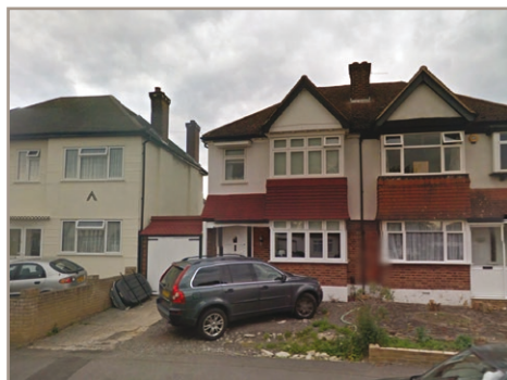
3 Beechwood Avenue

3 BEECHWOOD AVENUE: A proposal to erect a single storey rear extension is to be decided on the basis of 'prior approval'. This entails informing owners and occupiers of adjoining dwellings and them being given the opportunity to comment and 21 days to do so. Should no objections be raised, the application can proceed - otherwise it would need planning permission in the usual way. ♦