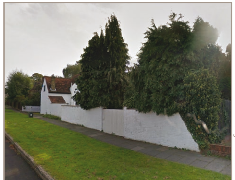
2 Arlington Drive

An earlier application to erect two new detached two-storey houses (4 and 6 Arlington Drive), with detached double garages having been refused by the local authority, a modified application has been submitted without the double garages, but with two new vehicular crossovers. As an association, we do not consider that the proposed changes would make a significant difference, particularly given the proximity of the Grade-2 listed building, Little Manor House, and will reiterate our previous opposition to the plans.