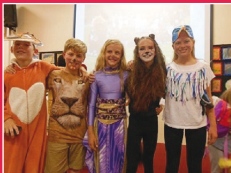
Castmembers of The Lion King