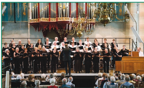
The Harrow Choral Society performing in the Grote Kerk in Monnickendam