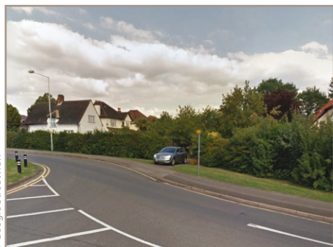
Rear of 2 Old Hatch Manor

dwelling on land to the rear of the existing house, but constitutes 'back garden development' which is not considered conducive to the existing local street scene, giving a crowded appearance to the site and not harmonising with other dwellings. We have raised our concerns with the local planners and await their decision.