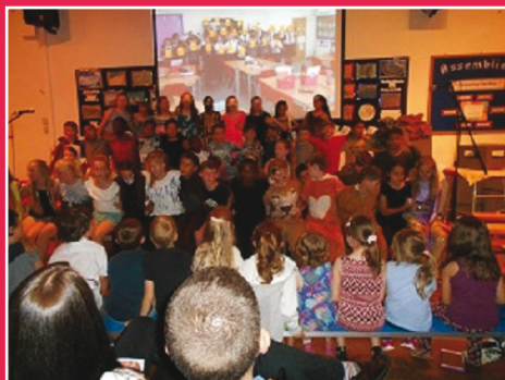
BWI's Year 6 Production of The Lion King

On Friday, July 14th, the Infant and Junior Schools hosted a Celebration which was held on the school field on a lovely, sunny afternoon. Both schools had much to celebrate this past academic year. They have formed a Federated Governing Body which means they have one Governing Body, resulting in the schools working more closely than they had in the past for the benefit of staff and pupils. The Junior School was graded Good at its recent Ofsted inspection. In its previous Ofsted inspection the Infant School was graded as Outstanding . Teachers from both schools, together with governors, met to discuss what they jointly wished to have as their Vision and Ethos. The schools' Vision is to be An Outstanding Place To Learn which they hope to achieve through Creating Excellence, Engaging The Community & Improving Efficiency . The Ethos will expect all staff and pupils to adhere to the following Values: Ambition, Togetherness, Opportunity, Respect, Curiosity, Happiness – A Torch to carry forward for the future.