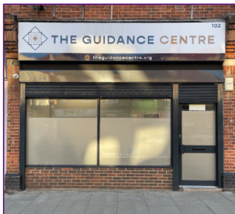
The Guidance Centre on Victoria Road

ing, and the occasional biscuit-fuelled brainstorming session. Our doors are open to everyone – regardless of faith, background, or how chaotic your life feels right now.