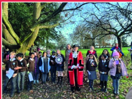
The Mayor and pupils with the Hinman Shield

They noted the work the colleges do to provide students and apprentices with programmes that enrich their learning including participating in meaningful trips and visits, accessing guest speakers from industry, gaining employability skills and much more. They are provided with opportunities to enhance their industry knowledge, acquire practical skills to