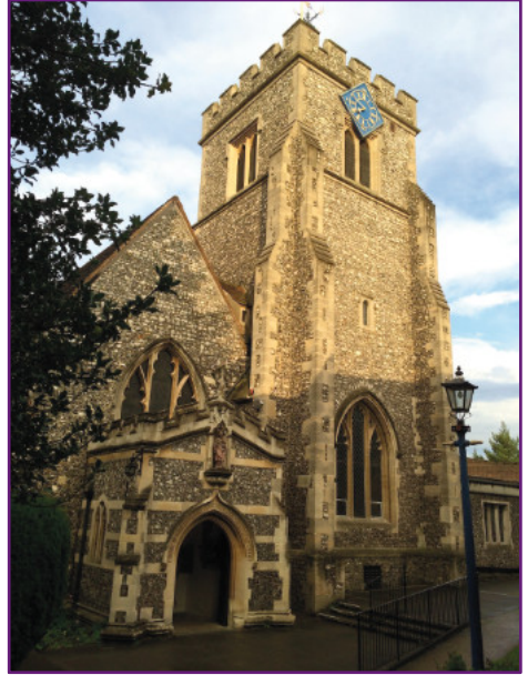
St Martin's Church

The church is usually open all day and offers a wonderful space for pausing from business to experience calm, prayer and meditation or to simply sit and think through challenges and plans. As you come from Manor Farm, the car park or the High Street come in and feel the sense of history that pervades this place. There is much to see and think about to enrich lives for all.