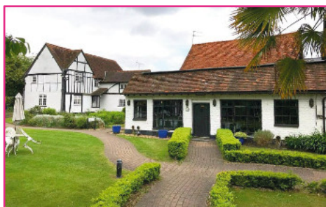
The Barn Hotel

meet their needs. Concerns have been raised about the impact on the local area, particularly around anti-social behaviour, and I know there is ongoing communication between local councillors, the police and nearby Waitrose.