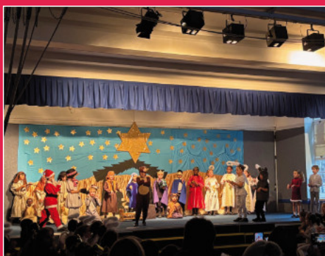
Some of the performers