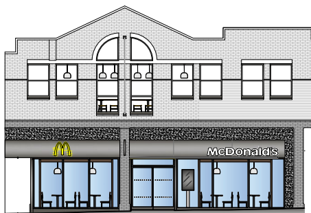
The proposed new McDonald's in Ruislip

www.ruislipresidents.org.uk/mcdonalds-plan-jan25/