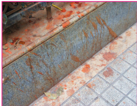
Staining caused by spitting Paan

is a foul habit that has no place on our high streets. I welcome that Ruislip councillors have requested for the area to be jet-washed, which has been escalated to the relevant cabinet member at the Council.