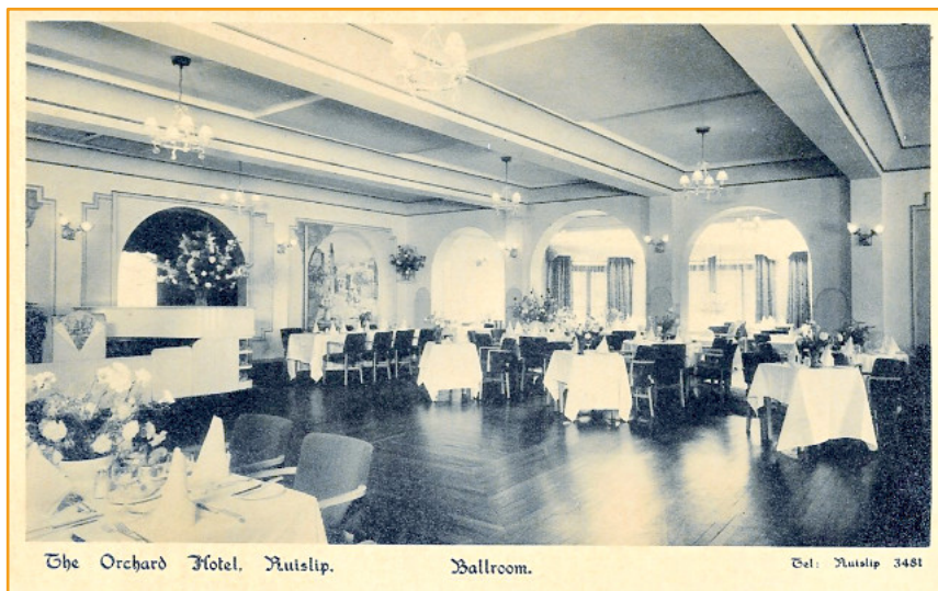
The Orchard Hotel, Ruislip.

In a way this building mirrors the changes in Ruislip during the first half of the 20th century. It began as a simple tea garden in a rural village which was transformed into a fashionable hotel and restaurant and then a steak house to serve a modern London suburb with a full range of amenities. ♦