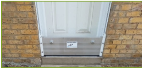
A flood barrier at King's College Pavilion