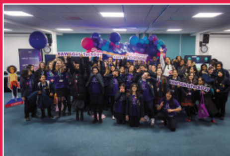
Girls' Tech Day at Uxbridge College