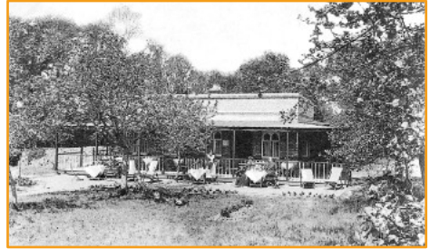
The original Orchard Bungalow

It started life as The Orchard Bungalow, a simple single storey structure built by Albert Cross in 1905. It was soon taken over by Mr and Mrs Raymont who marketed it very successfully as a tea garden to cater for the many day trippers coming out of inner London on the newly opened Metropolitan Railway extension from Harrow to Uxbridge. This extension and Ruislip Station opened in 1904 and soon established Ruislip and the neighbouring villages as popular locations for a day out in the country for those living in crowded inner London. Besides fresh air and countryside all these visitors needed refreshments and soon there were many establishments springing up to meet these needs.