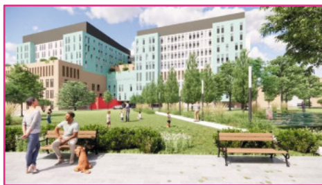
A rendering of the new Hillingdon Hospital

project with construction beginning within this Parliament.