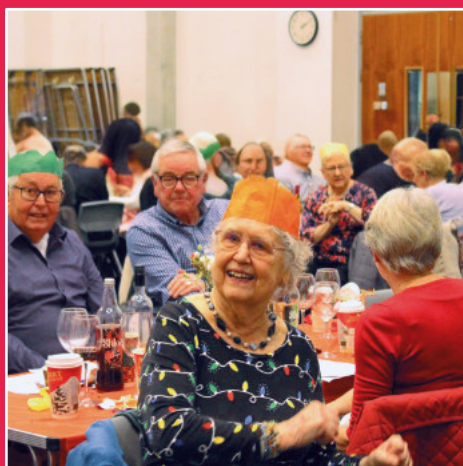
A table of Christmas lunch guests