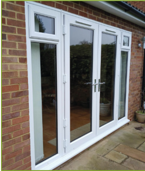
A flood-resistant patio door, designed to withstand 600mm of water