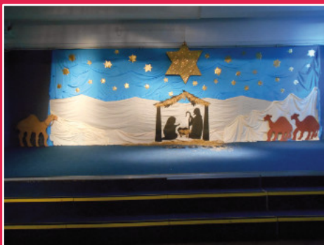
The backdrop of the show

During the past year the school held numerous events which included regular supportive coffee mornings for their families. All children from Nursery to Year 6 held Worries to Wellbeing workshops. They also marked special days or weeks such as Children's Mental Health Week with a variety of workshops.