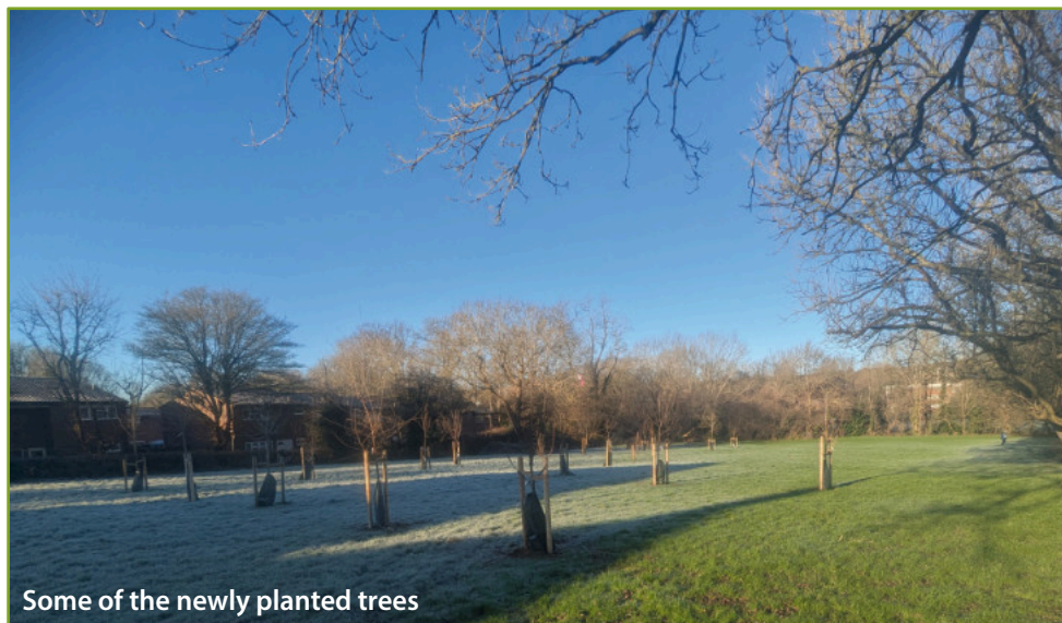
Some of the newly planted trees

We have now spent all of the funds we had amassed and so need to regroup for more fundraising opportunities along with new sites to plant trees. Please let me know if you have any workable ideas. ♦