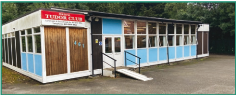
Tudor Club, Eastcote