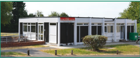
Elm Park Club, Ruislip Manor

To find out more about the Clubs, contact Elm Park on ☎01895 634962 or the Tudor Club on ☎020 8866 8603 between 10am and 12.30pm - we get busy serving lunch after then. ♦ www.rnofa.org.uk