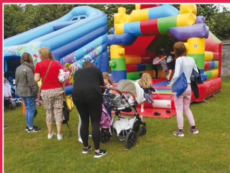
The Bouncy Castles at Lady Bankes School Platinum Jubilee Celebrations