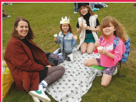
Picnicing at Lady Bankes School Platinum Jubilee Celebrations