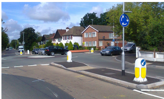
Eastcote Road - layout changes (see page 19)