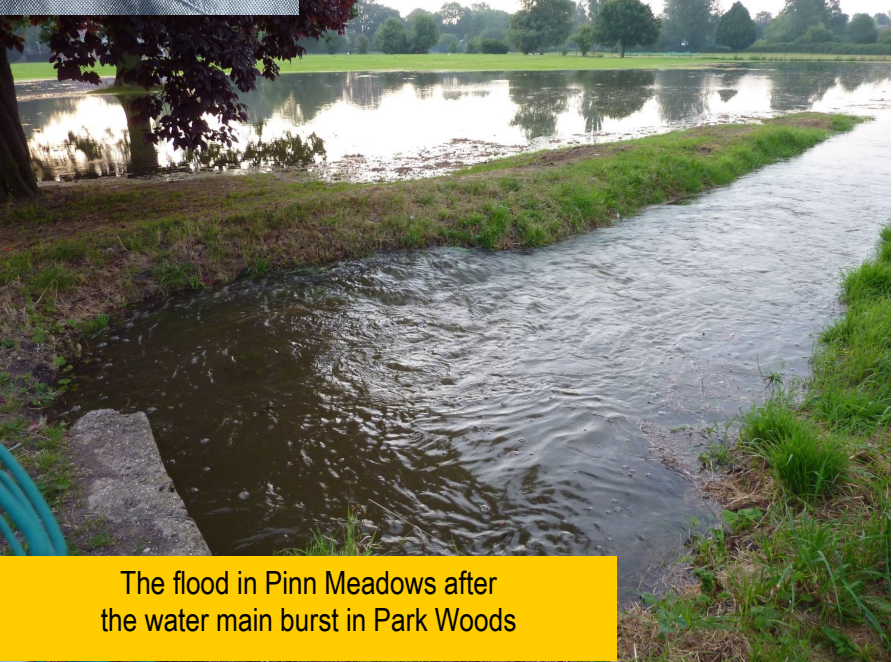
The flood in Pinn Meadows after the water main burst in Park Woods