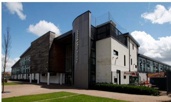
Ruislip High School (see page 12)