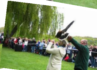
...and then conjuring a hat out of a bird!