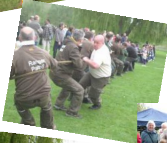
...and even more surprised lose the tug-o-war to a handful of Ruislip under 10's.