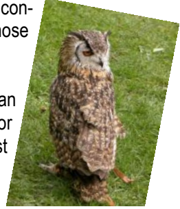
"Did I put my head or my body on back to front this morning?"