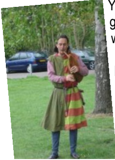
"It's just all blow at these events..."

Many hundreds of people braved an unseasonably cold spring day for what was undoubtedly the best open day yet.