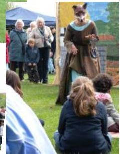
...while this foxy lady and her friends enthralled all ages with their tales of Reynard the Fox

Looking forward to next year's Ruislip Woods Open Day? Most definitely!