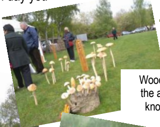
Wood's Rangers were surprised by the appearance of a previously unknown variety of giant mushroom.