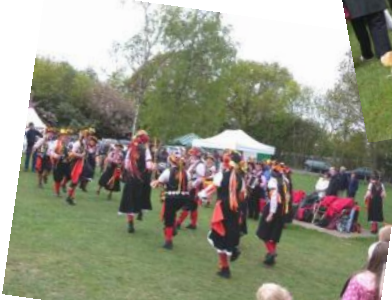
Someone shouted "beer tent" and got trampled in the rush