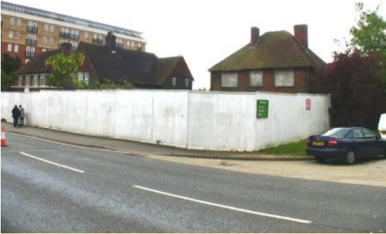
Recognize this blot on our Ruislip Townscape? P8