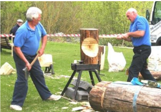
I'm a lumberjack and I'm OK... 13th Ruislip Woods Open Day, back cover