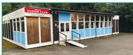
Tudor Club, Eastcote

Unlike other local boroughs, Hillingdon recognises the benefits of such lunch and social clubs and, as a local charity, they support us with a grant to subsidise the cost of the meal for residents. Our small team of part-time employees and volunteers provide the support that many of you want and need.