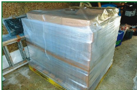
What 10,000 copies of the Town Crier look like!