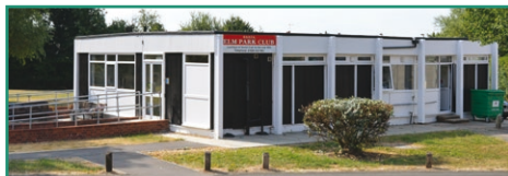
Elm Park Club, Ruislip Manor

The Elm Park Club on Park Way in Ruislip Manor and the Tudor Club on Field End Road in Eastcote are lunch and social clubs for the over 60s where you can have lunch with the company of others every weekday. At present, the clubs offer a 3-course lunch, cooked on the premises, for £4.50 for residents of Hillingdon. Two afternoons a week activities offered include bingo, arts & craft and quizzes. Every month there is an extra activity, either an entertainer visiting the club or an outing to places of interest. These events often take place on a Saturday to offer you another day when you are not home alone.