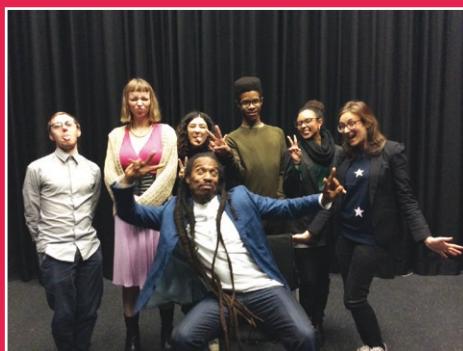
Benjamin Zephaniah & English Students