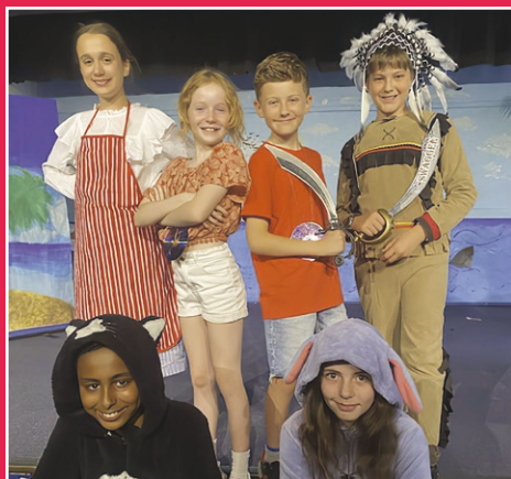
The Periwinkle Family & Pets