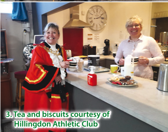
3. Tea and biscuits courtesy of Hillingdon Athletic Club