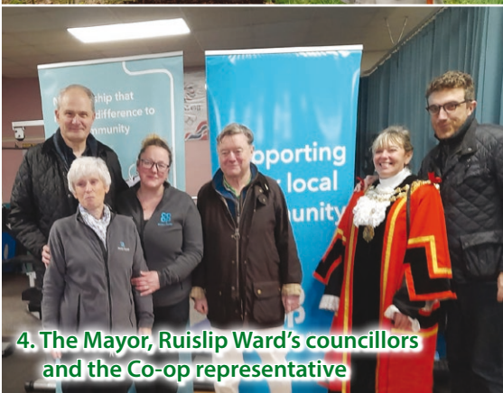
4. The Mayor, Ruislip Ward's councillors and the Co-op representative