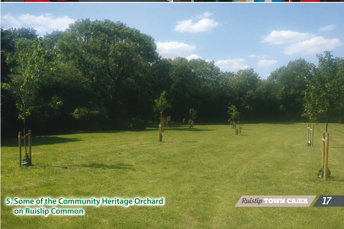
5. Some of the Community Heritage Orchard on Ruislip Common