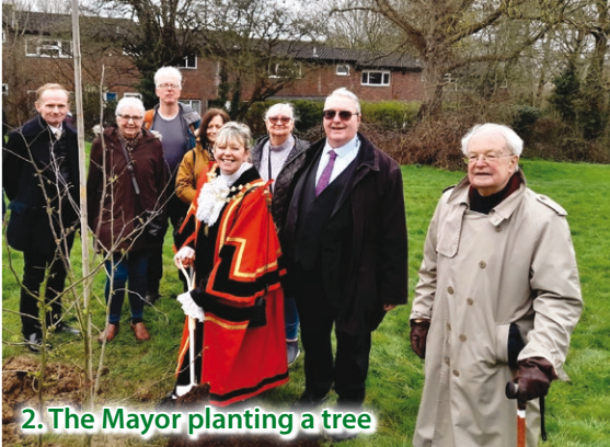
2. The Mayor planting a tree