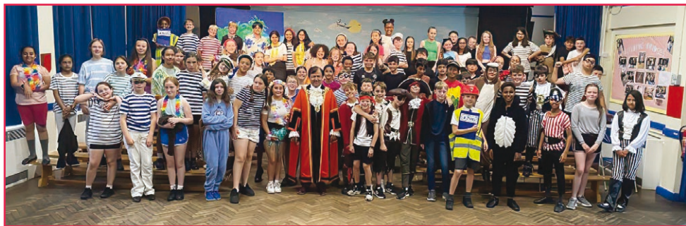
The cast with the Mayor of Hillingdon